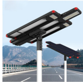
ENERGY SAVING IP65 WATERPROOF ALUMINUM SMD STREET LIGHT 360W ALL IN ONE SOLAR LED STREET LAMP