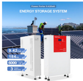
OEM ODM POWER WALL SOLAR HOME RECHARGEABLE BATTERY 48V 100AH HOUSEHOLD SOLAR ENERGY STORAGE BATTERY PACK