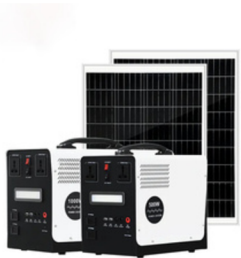
HIGH LUMEN 500W OUTDOOR CAMPING FISHING HOME MOBILE PORTABLE SOLAR PANEL SOLAR ENERGY SYSTEM