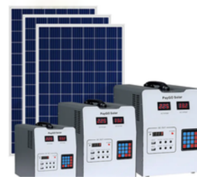
NEW PORTABLE 500W SOLAR SYSTEM