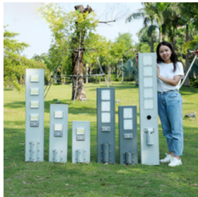
50W 100W 150W 200W IP65 OUTDOOR INTEGRATED MOTION SENSOR ALL IN ONE SOLAR LED STREET LIGHT