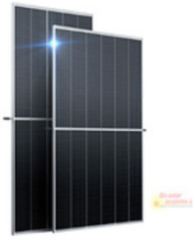
MONOCRYSTALLINE & POLYCRYSTALLINE SOLAR PANEL CELL SYSTEM PRICE FOR HOME USE