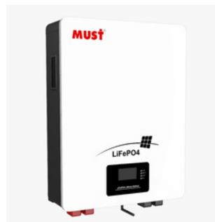
MUST 10.24KWH HIGH-CAPACITY LITHIUM ION PHOSPHATE BATTERY