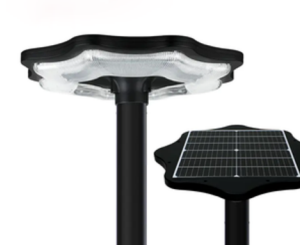
MULTI HEAD OUTDOOR WATERPROOF IP65 ROUND SOLAR STREET LIGHT 60W SOLAR GARDEN LAMP