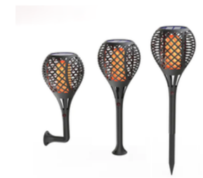
TORCH LIGHTS REALISTIC DANCING FLAMES LAMP ABS IP65 WATERPROOF OUTDOOR LAWN LED SOLAR GARDEN LIGHT POPULAR LIGHT