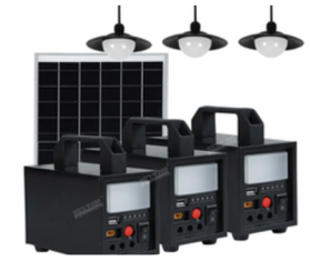
NEW PRODUCT SOLAR ENERGY POWERED 20W 40W 60W SOLAR SYSTEM