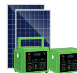
SOLAR PANEL SYSTEM HOME SYSTEM OFF GRID COMPLETE FOR AFRICA BATTERY ENERGY PANELS SOLAR POWER SYSTEM