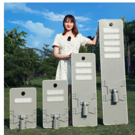
50W 100W 150W 200W IP65 OUTDOOR INTEGRATED MOTION SENSOR ALL IN ONE SOLAR LED STREET LIGHT