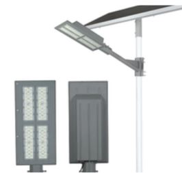
HIGH LUMEN OUTDOOR WATERPROOF ROAD LIGHTING IP65 SMD 180W SOLAR LED STREET LIGHT