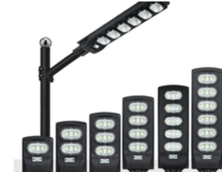
2023 NEW OUTDOOR WATERPROOF 50W 100W 150W 200W INTEGRATED ALL IN ONE LED SOLAR STREET LIGHT