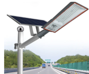
WATERPROOF HIGH LUMEN BRIDGELUX ALUMINUM IP65 ALL IN ONE SOLAR LED STREET LIGHT