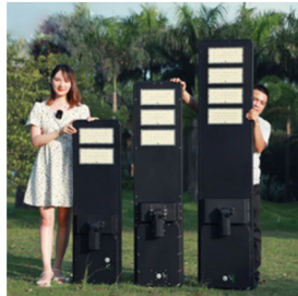
ALL IN ONE SOLAR STREET LIGHT 300W IP65 OUTDOOR SOLAR STREET LIGHT WITH HIGH QUALITY