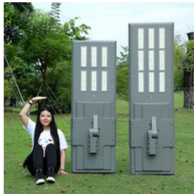
OUTDOOR IP65 INTEGRATED LED SOLAR STREET LIGHT