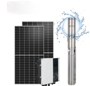
CENTRIFUGAL SUBMERSIBLE BOREHOLE SOLAR WATER PUMP FOR AGRICULTURE IRRIGATION