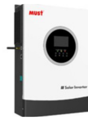
MPPT SOLAR INVERTER HYBRID INVERTER SOLAR BATTERY PACK WITH BUILT IN WALL