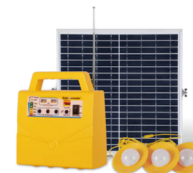
HOME PORTABLE 20W SOLAR POWERED GENERATOR SOLAR PANEL SYSTEM OFF GRID HOME SOLAR POWER SYSTEM SOLAR KIT