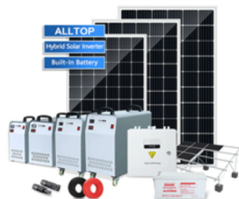
HIGH QUALITY SINE WAVE INVERTER FOR BATTERY BANK 1KW, 2KW, 3KW, 5KW, 6KW, UPTO 90KW SOLAR POWER SYSTEM